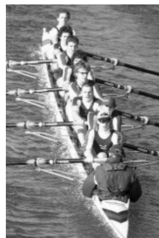
Men's 1 st Torpid: